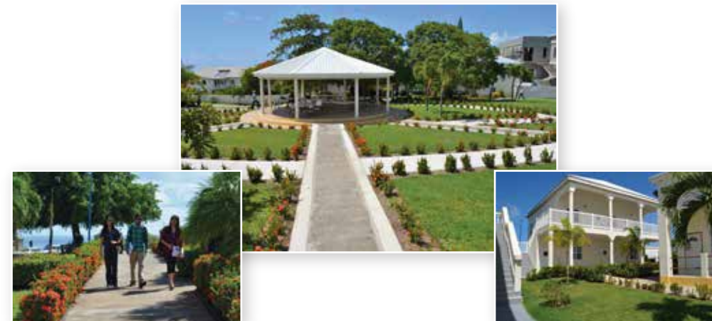
ST. KITTS, CARIBBEAN

by a prime minister. The name of the capital, Basseterre, reflects the French heritage of much of St. Kitts' history. Until recently, St. Kitts and Nevis were primarily agricultural, with sugar cane as the main crop; however, new road construction and economic growth are beginning to bring the islands into the mainstream of the tourism industry, and they are becoming known as pleasant and comfortable vacation destinations.